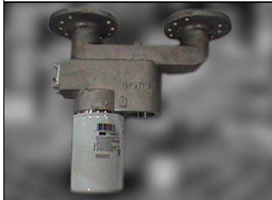
Twin Meter Check