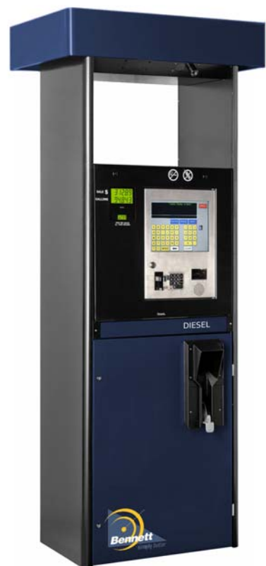
Bennett/Fiscal Integrated Self-Service Dispenser (also available for two product dispenser)

We are the only dispenser supplier to offer two master products on the front side and two satellite products on the rear side in a single, compact 30-inch wide high hose cabinet.