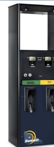
Two Product High Hose Master

And, of course, if you happen to like traditional low hose style dispensers, we offer them as well in various product configurations. (not available with integrated Fiscal Payment Terminal)