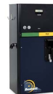
Low Hose Master