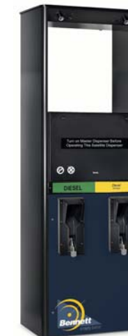
Two Product High Hose Satellite

All Big Squirt models shown are available in master/ satellite combination