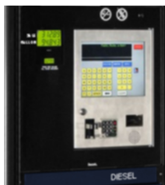
Fiscal Outdoor Payment Terminal in Dispenser is a quick and easy Field Installed Option