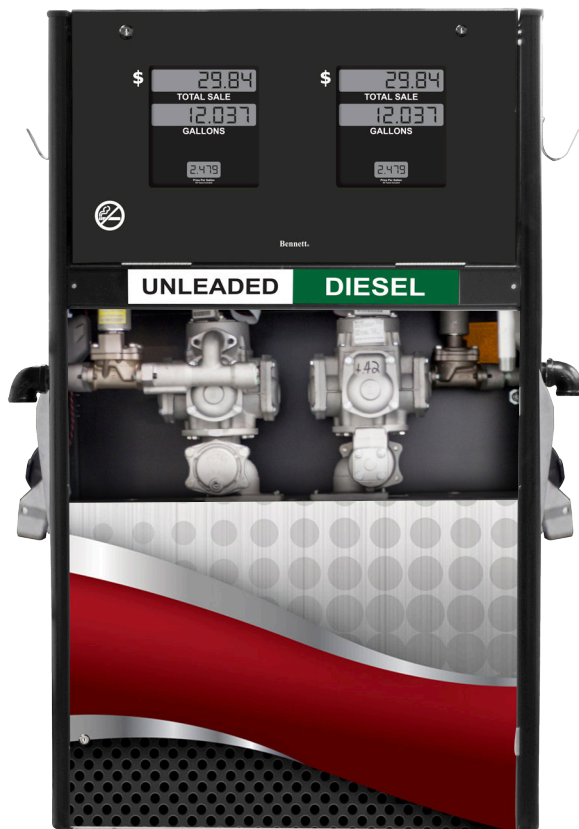
Shown with Remote Hydraulics

Regulatory: UL™ Listed, Weights and Measures