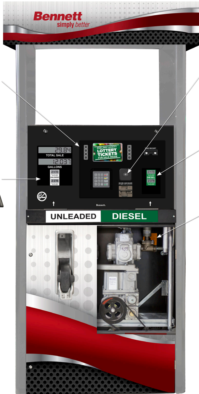
Shown with Suction Hydraulics

The cabinet width has been extended by 6" (low hose) and 8" (high hose). This provides more room for payment systems in the upper cabinet & plumbing installation and serviceability in the lower cabinet.