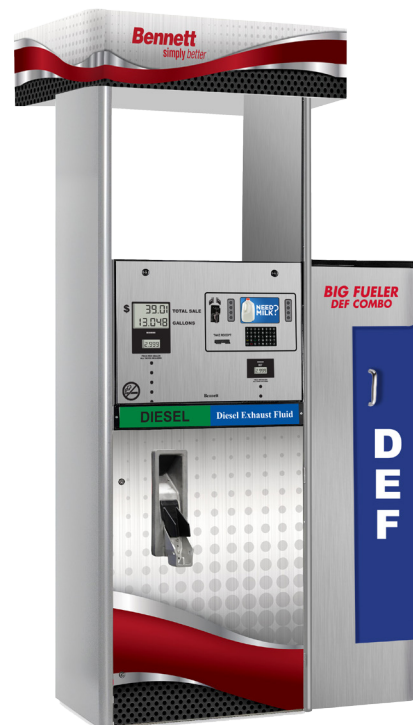
Big Fueler Diesel/DEF Combo shown with Alphanumeric Keypad and 7" Widescreen Display

Flow rates are nominal rates under test conditions. Actual rates will vary subject to installation conditions, hanging hardware used and submerged pump (if applicable).