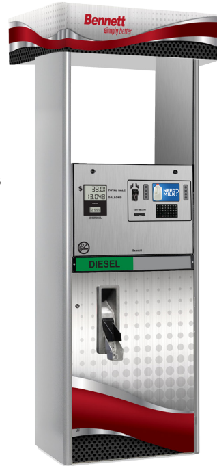
Big Fueler shown with Alphanumeric Keypad and 7" Widescreen Display