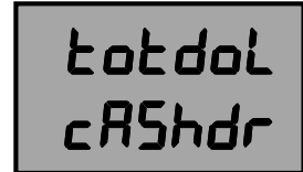
Figure 60.2 – Six-Digit Display