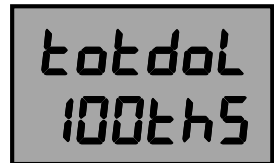
Figure 60.3 – Eight-Digit Display