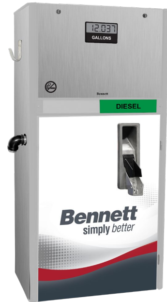
Big Fueler low hose shown with commercial display

* To achieve 60gpm (remote) or 40gpm (satellite), a master and satellite simultaneous flow is required. Flow rates are nominal rates under test conditions. Actual rates will vary subject to installation conditions, hanging hardware used and submerged pump (if applicable).