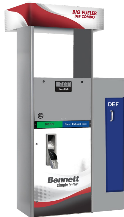
BlueFueler Diesel DEF Combo shown with commercial display