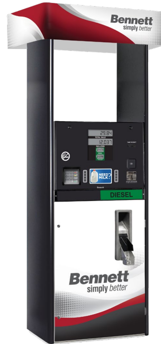
Big Fueler shown with alphanumeric keypad and 7" widescreen display

* To achieve 60 gpm (remote) or 40 gpm (satellite), a master and satellite simultaneous flow is required. Flow rates are nominal rates under test conditions. Actual rates will vary subject to installation conditions, hanging hardware used and submerged pump (if applicable).