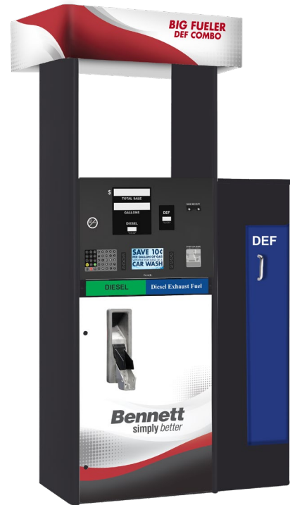
Big Fueler Diesel/DEF Combo shown with alphanumeric keypad and 7" widescreen display