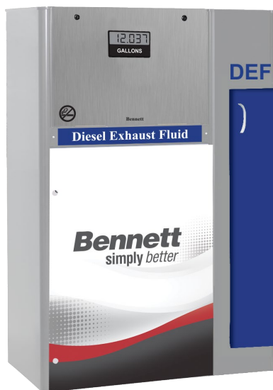
310D DEF dispenser