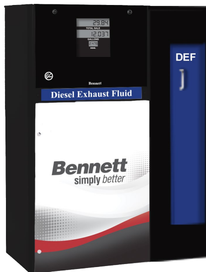
410D DEF dispenser